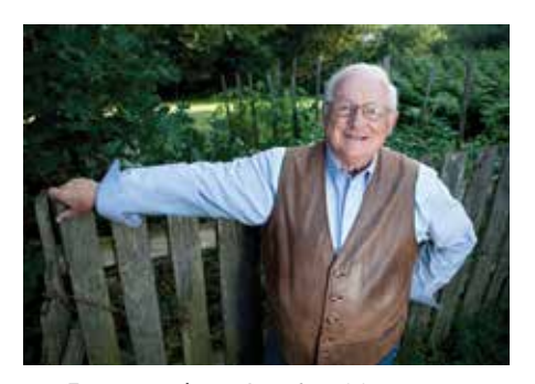
For more about Jerry's writing, go to www.jerryapps.com.

Not only were the one-room schools places for learning, they also served as community gathering places. Country schools also provided an identity for rural communities. People referred to where they lived by the name of their school. When these schools closed and children were bussed to nearby village schools, much more was lost than merely a school.